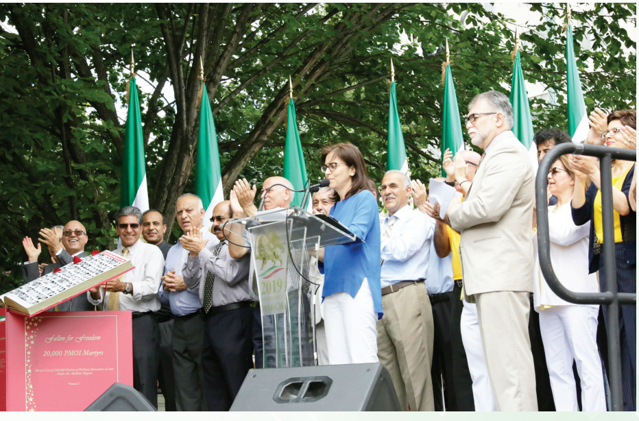
Leaders of Iranian American communities speaking at the Free Iran Rally