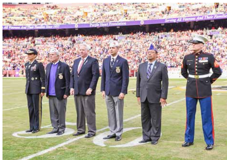
LANDOVER, MD - NOVEMBER 12, 2017: Field activities at Fedex Field in Landover, MD during Washington Redskins vs. Minnesota Vikings Game on November 12, 2017.