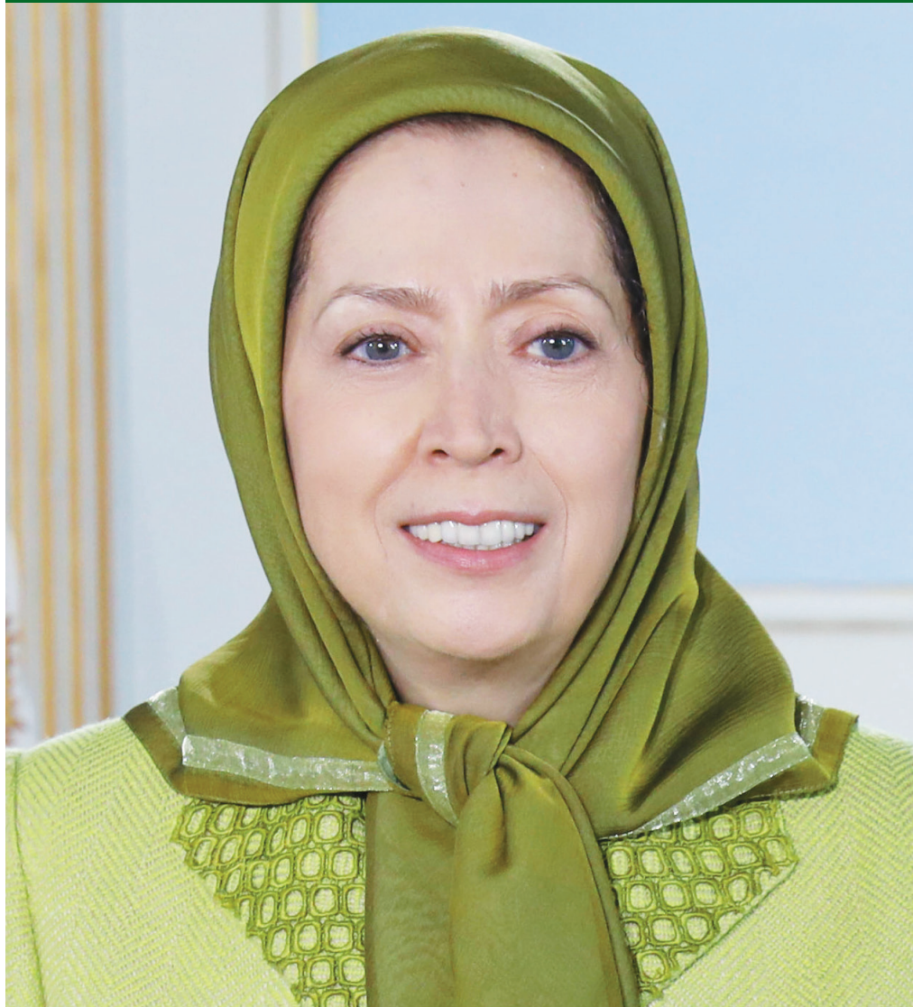
Mrs. Maryam Rajavi

President-elect of the National Council of Resistance of Iran (NCRI)