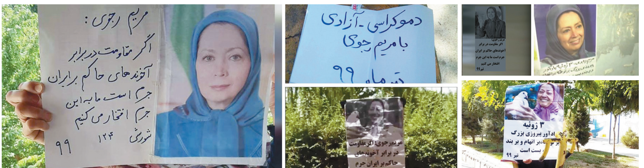
Signs for freedom in Tehran streets. Translation: "Democracy, freedom, with Maryam Rajavi." (July 12, 2020)