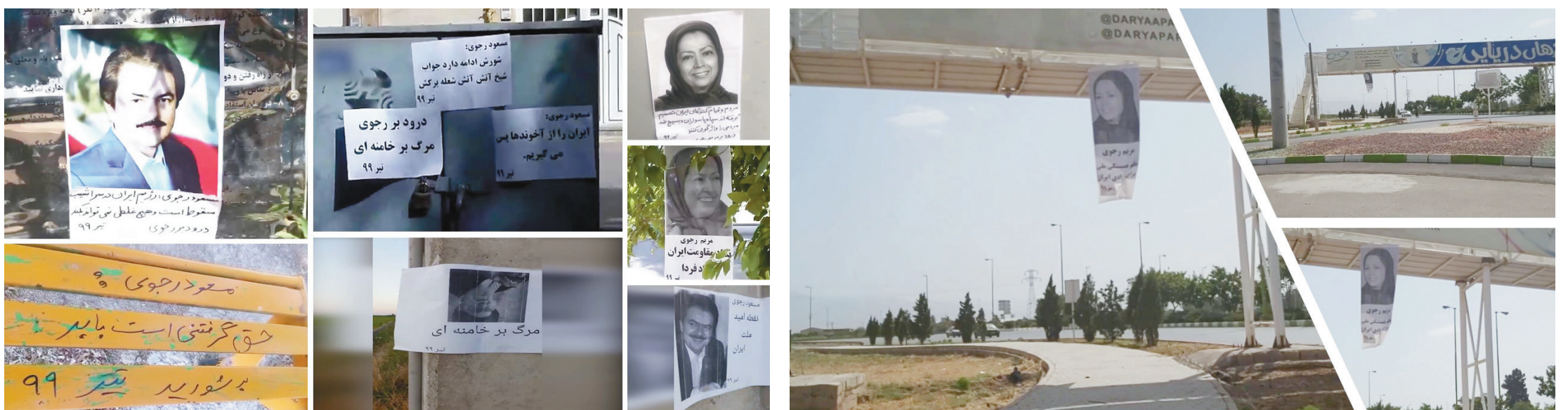
Banners and placards praising resistance leaders in Tehran, Rasht, and Omiyeh. Translation: "Massoud Rajavi is the Iranian people's inspiration." (June 30, 2020)

At the same time, an increased number of young people joining the ranks of the Resistance Units garnered the attention and concern of Khamenei, Rouhani, the Judiciary Chief, and others. In May 2020, the Judiciary announced the arrests of two award-winning students at Tehran's Sharif University of Technology because of their alleged ties to the MEK. The two students had won gold and silver medals in The International Olympiad on Astronomy and Astrophysics.