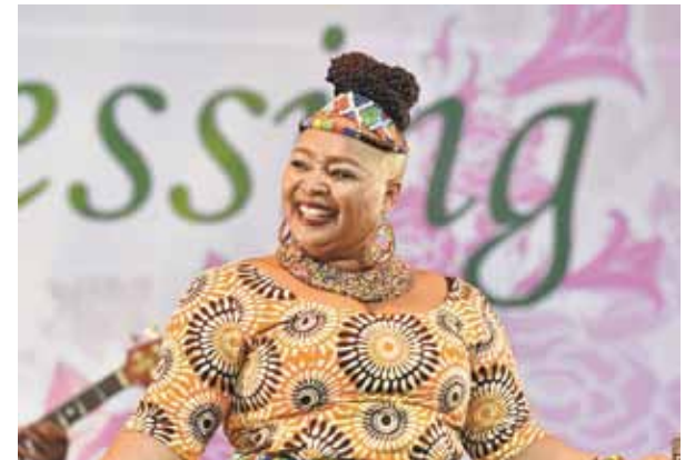
South African singer Khanyo Maphumulo gave an inspiring performance.