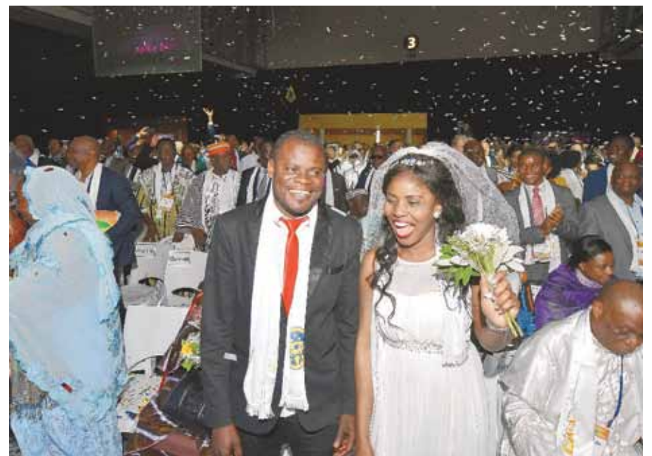
One of the happy couples who attended the Blessing Ceremony.