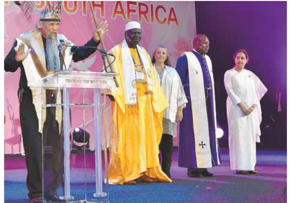
Clergy leaders from multiple faiths offered a welcoming prayer.