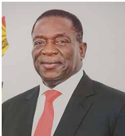
By His Excellency Emmerson Mnangagwa, Zimbabwe President

The following are President Mnangagwa's remarks on Nov. 21, 2018, at the National Sports Stadium in Harare, Zimbabwe, during the Peace and Family Festival, Zimbabwe Hyojeong Cosmic Blessing. Masvingo Provincial Affairs Minister Josiah Dunira Hungwe delivered the remarks.