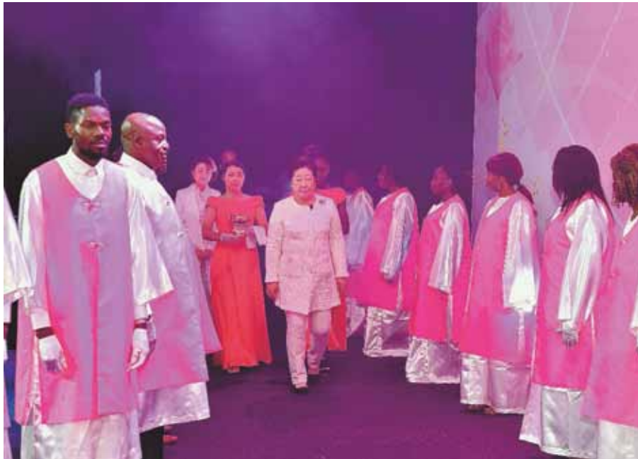
Dr. Hak Ja Han Moon entered to officiate at the Blessing Ceremony.

Cape Town International Convention Center, Cape Town, South Africa, Nov. 24, 2018