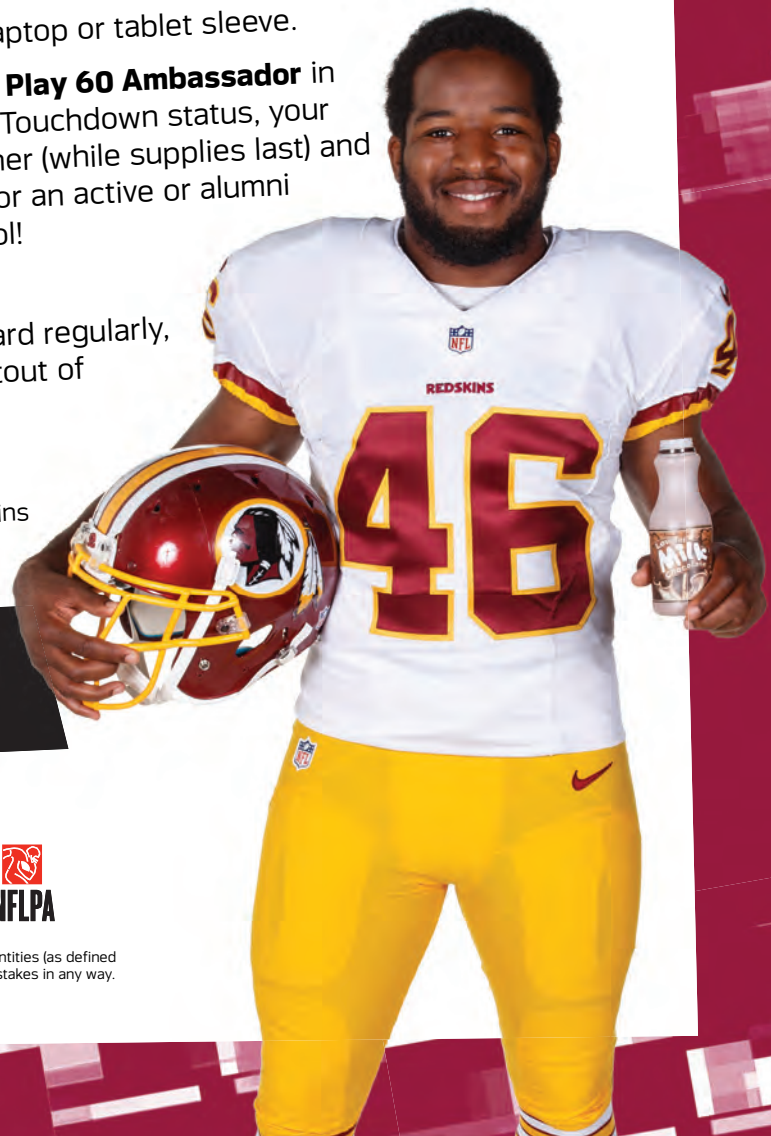
Alfred Morris #46 Running Back Washington Redskins

For more information, visit: FuelUpToPlay60.com and www.dairyspot.com/schools/fuel-up-to-play-60/ and www.facebook.com/MidAtlanticFuelUpToPlay60