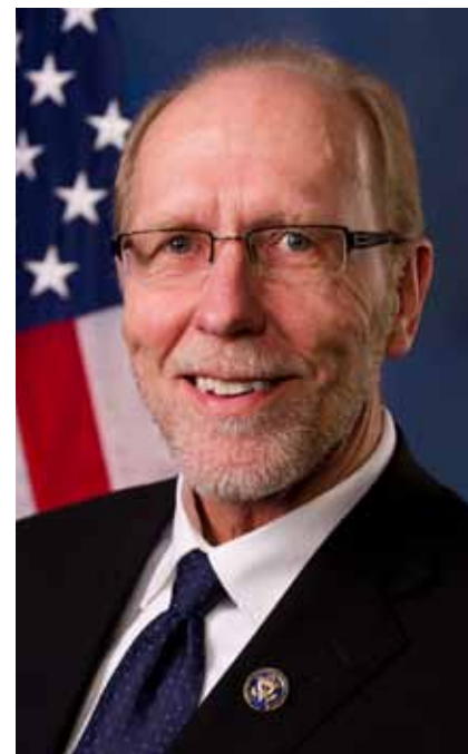
Representative Dave Loebsack (D-IA)

private investment work to strengthen the renewable energy sector's position in the free marketplace and power America's carbon-free energy policies forward. Consider that 72 percent of a wind turbine's value today is made in the United States, compared to 25 percent in 2005. Over the past few decades, wind energy in the United States has changed the economic and energy landscape with nearly 900 utility-scale wind projects on the nation's electricity grid and more than 550 wind-related manufacturing facilities.