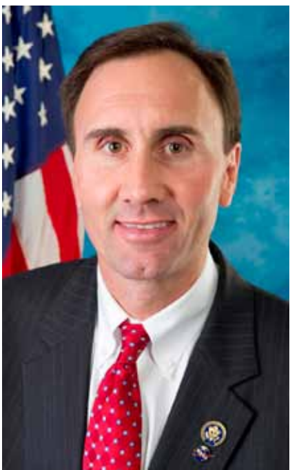
Representative Pete Olson (R-TX)

After a record-breaking long, harsh winter, Americans are already bracing themselves for a summer that will see the thermostat—and electric bills—spike. That fact is part of why whether for controlling the temperature in our homes, filling up the gas tank or cooking the family dinner, a reliable, affordable energy supply is critical for all Americans.