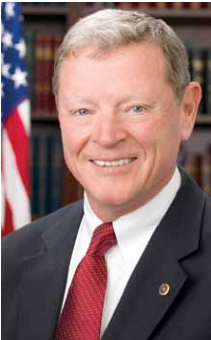
Senator Jim Inhofe (R-OK)

If one word were to characterize the Obama Administration's posture toward the economy it would be