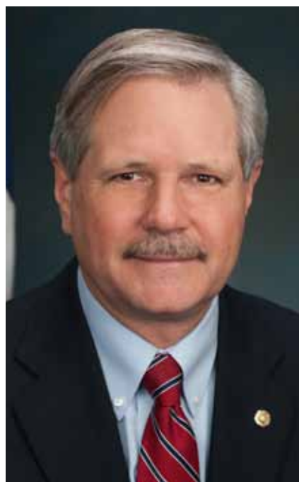
Senator John Hoeven (R-ND)

The U.S. Can Strengthen Our National Security, Help Our Allies, Create Jobs, Boost Our Economy and Reduce Flaring