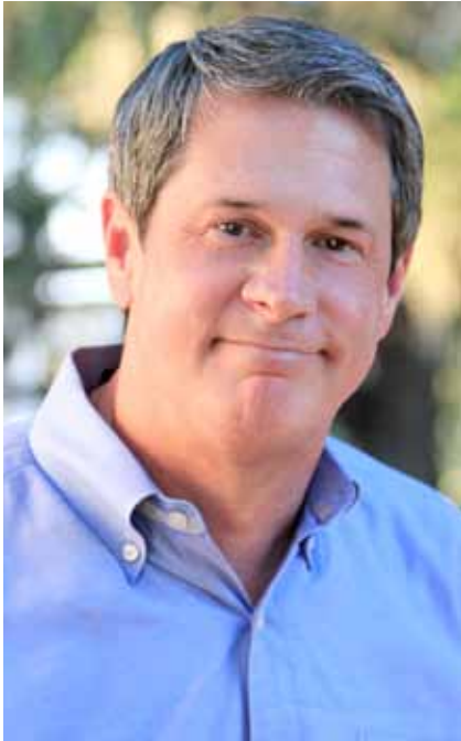
Senator David Vitter (R-LA)

Home-grown American energy, particularly natural gas, has produced a real job boom across America. It's clearly the brightest spot in our nation's otherwise