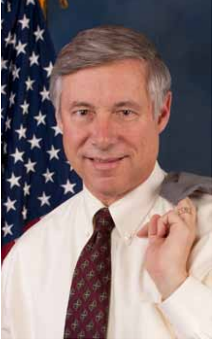
Representative Fred Upton (R-MI)

Technological advances have dramatically transformed our lives over the last decade. Thanks to new advancements and American ingenuity,