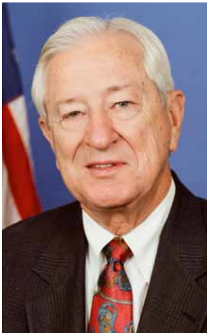
Representative Ralph Hall (R-TX)

I make it a point to go home every weekend to visit with folks in the Fourth District of North East Texas, which I represent. The top concern I continue to hear from people is their personal security - their families, their pocketbooks, and their jobs.