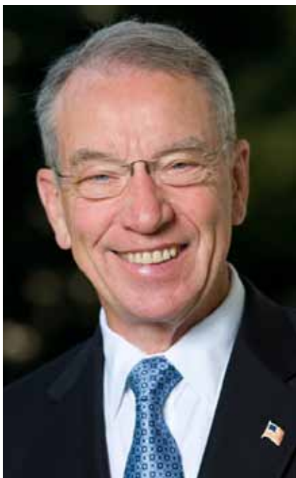
Senator Chuck Grassley (R-IA)