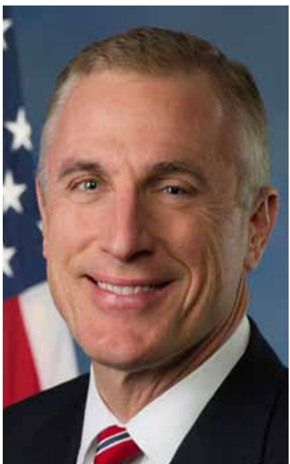
Representative Tim Murphy (R-PA)

Last fall, 380 workers at the Hatfield's Ferry and Mitchell Power Stations in southwestern Pennsylvania lost their jobs when these two coal-fueled plants permanently shut down. After just having invested hundreds of millions of dollars in environmental upgrades to the facilities, owner FirstEnergy stated the decision was based in part on "the cost