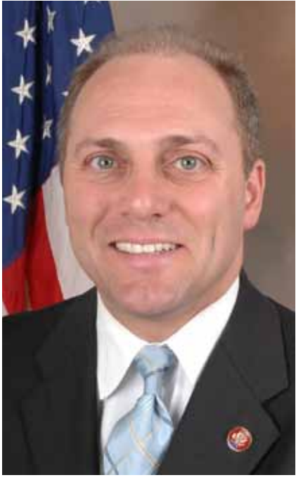
Representative Steve Scalise (R-LA)

Since the Great Recession of 2008, the debate in Washington, D.C. has been loaded with ideas for how to get our economy moving again. To find the quickest and most proven recipe for jumpstarting America's economy, the answer in many cases is right below our feet if we are only allowed to explore. American energy creates high-paying jobs, grows our economy, and provides billions in royalties and tax revenues to reduce our deficit. Louisiana's First Congressional District, which I am honored to represent, is now home to the