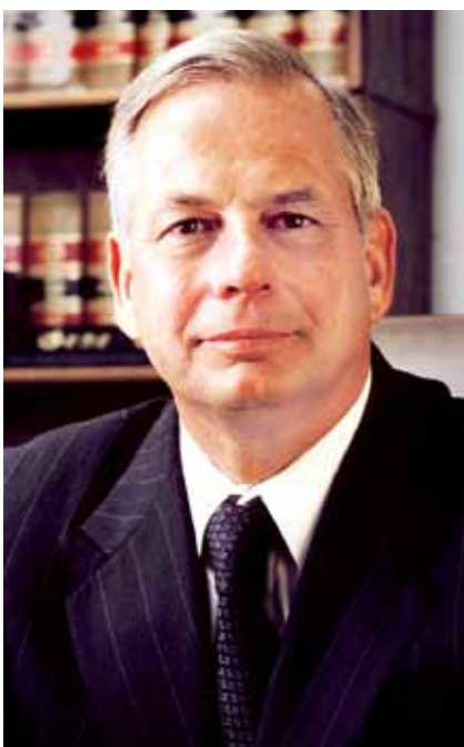
Representative Gene Green (D-TX)

For decades, the United States has been a global leader in developing Liquefied Natural Gas (LNG). The first LNG facility was built in West Virginia in 1912, and in 1971, the U.S. began importing LNG to supplement domestic production. Over time, with