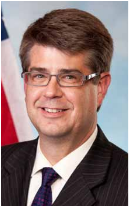
Representative Lee Terry (R-NE)

Last week, Rolling Stone ran a story that quoted two Obama Administration officials who said the President had all but made up his mind to deny the permit to build the Keystone XL pipeline.