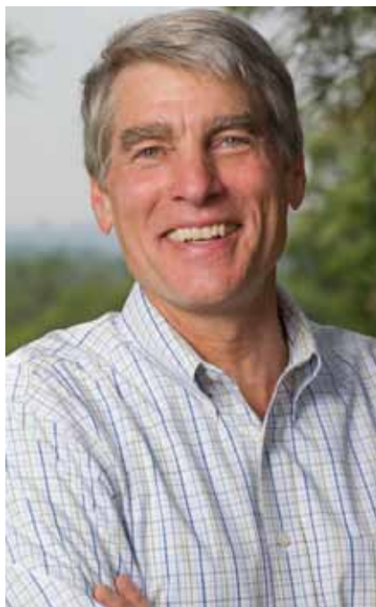
Senator Mark Udall (D-CO)