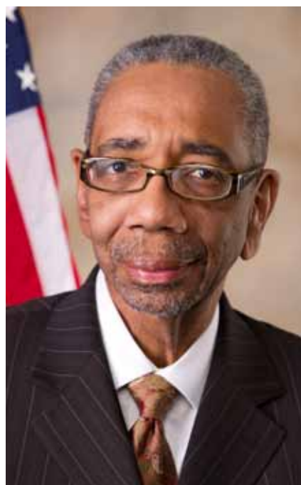
Representative Bobby Rush (D-IL)

There's no secret that the field of energy is the latest gold rush for our country, but with more viability that will sustain our way of life for centuries. The mystery lies in who is aware of this ever evolving and increasingly economically viable frontier that's changed the playing field internationally and positioned the U.S. as the country that leads the world in advanced energy technologies, energy production, and clean and renewable energy breakthroughs. This guarantees the U.S. will also lead the global race for economic superiority; hence it's imperative that the United States remains in the forefront in each of these areas and is inclusive of all people.