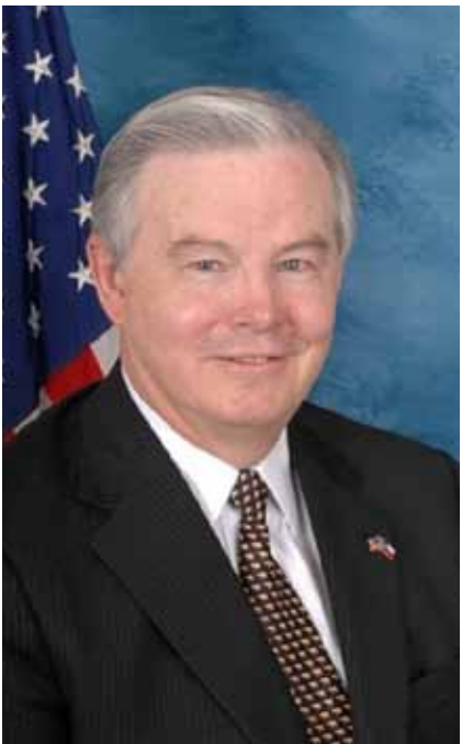
Representative Joe Barton (R-TX)

America's new found energy abundance creates incredible opportunities, but old laws are getting in the way of economic growth and the chance to strengthen security here and abroad.