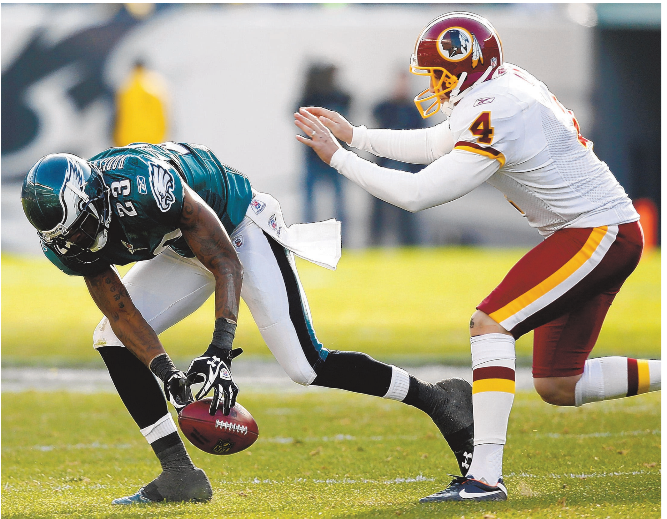
ASSOCIATED PRESS PHOTOGRAPHS